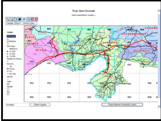
Figure1: Adana Orthophoto Production Project Area

Digital Camera is purchased by GDLRC for OIS. Furthermore two adjudications, named 1/5000 Scale Digital Colour Orthophoto Production Work, that contain Adana and Izmir but include Adana, Izmir, Mersin and Manisa were realized on 29.06.2009. These two work area are search and find on metadata portal web site (Figure1 and Figure2). Orthophotos are one of the requirements in Annex2 in INSPIRE and the metadata of these should be created.