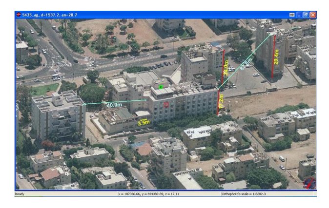
Figure 5. Height and distance measurements (Aeromap, 2006)

Powerful measurement capabilities help users to compare buildings and structures for any kinds of planning purposes. In addition, designing pylon construction can be handled easily. Line of sight analyses have an important role at urban and infrastructure planning as well.