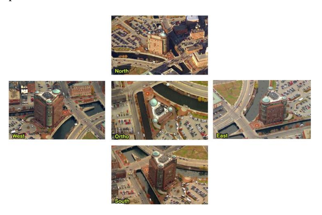
Figure 4. Five views of a building (Nelson, 2008)

This configuration generally provides minimum 12 and maximum 24 images of a point, which allows the establishment of image libraries by gathering images meeting the quality standards after the completion of photogrammetric processes.