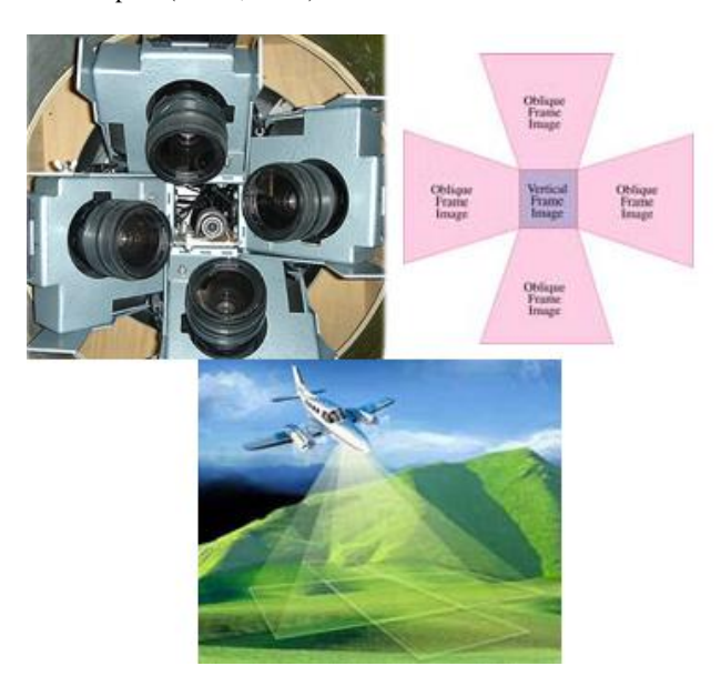
Figure 3. Five camera system (Petrie, 2008)

There are many camera systems used in oblique photogrammetry. As already mentioned, approaches differ from single camera to multiple camera systems. The most preferred and effective system is accepted as the one having vertical and oblique cameras together. Track'Air Aerial Survey Systems - MIDAS, Pictometry - PENTA DigiCam, Hexagon Geosystems - Leica RCD30 and Microsoft - UltraCam Osprey can be given as examples (Petrie, 2008).