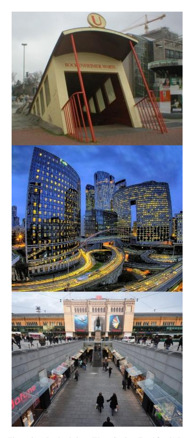
Figure 2. a) Bockenheimer Warte Station, Frankfurt b) La Defense District, Paris c) Subsurface Shopping Places at Central Station, Hannover

At this point, the necessity of 3D cadastre concept and 3D property data is confronted.